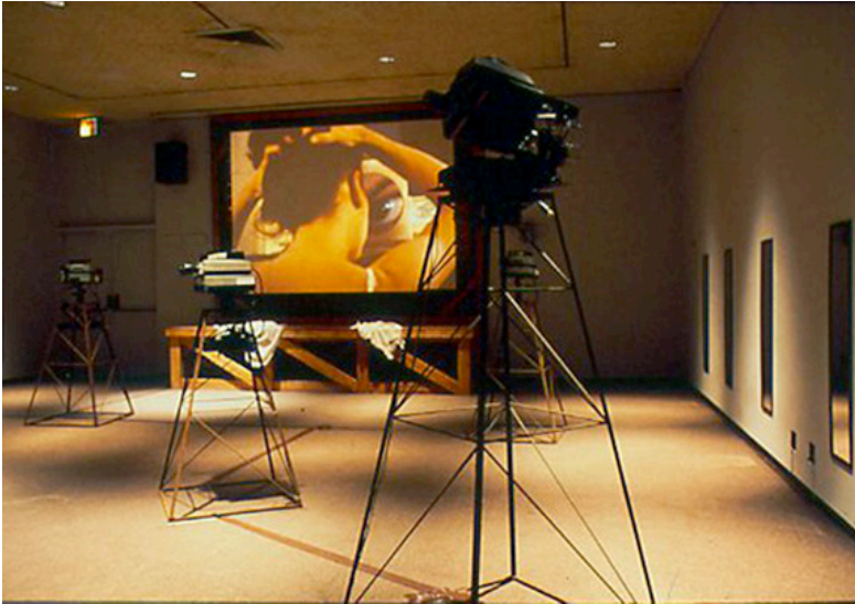
X-Rayed, 1988, Whitney Museum of American Art (image, the model) 20 minute multi-image dissolve program, 300 35mm slides, 8 slide projectors, sound

In 1987 I developed "X-Rayed", an immersive theater of mutability. "X-Rayed" was a calling to audiences, and myself, to enter into a psycho-somatic engagement with interiority and social identity, an evocation to awaken and confront abandoned selves, predators, ancestry, sexuality...death...to see whom we can become.