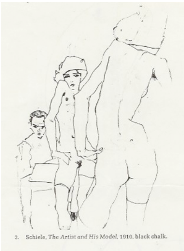
3. Schiele, The Artist and His Model , 1910, black chalk.