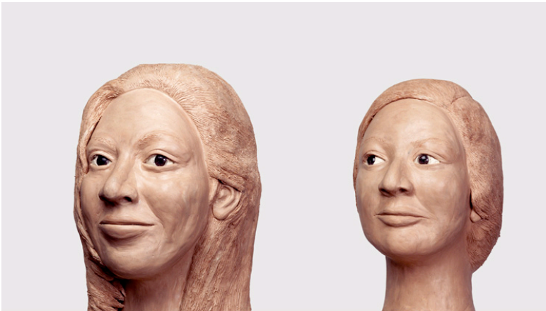
Sightlines, 2005, from a photographic series, Los Angeles County Museum of Art Each woman's gaze will forever seek to see and be seen by the other.