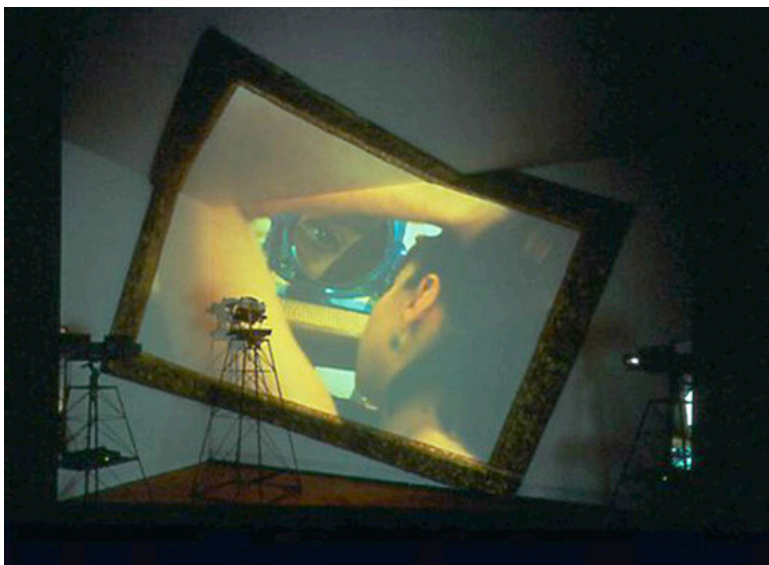
X-Rayed (Altered), 1990, San Francisco Museum of Modern Art (image, the artist)

A woman explores herself while being watched. Can she maintain her attention and not lose herself to the gaze/desire of another? The other in this case was me, another woman using the camera as a scope, to see of her model what she could not see of herself.